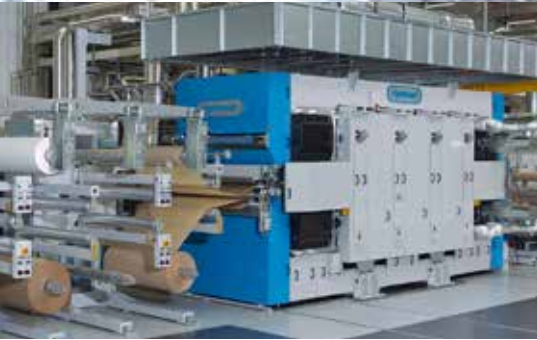
Double Belt Presses