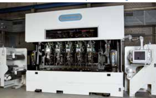
Digital Printing Lines