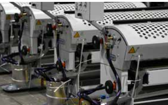
Liquid Coating Lines