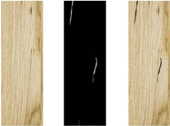
Adding characteristics, such as cracks, knots or colouring using a digital printing mask