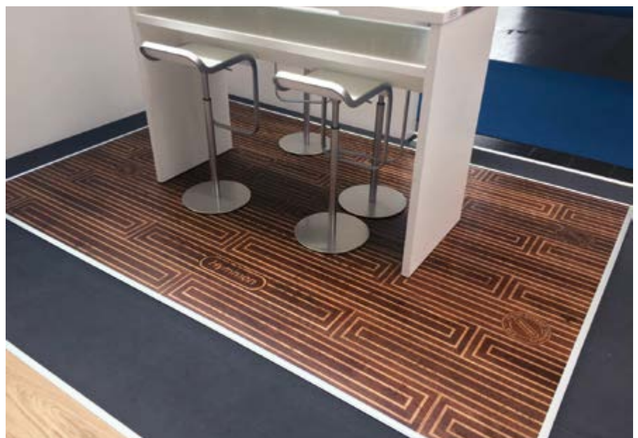
A floor produced using digital staining was shown for the first time at Ligna 2019, the trade fair for woodworking and wood processing plant, machinery and tools, in Hannover