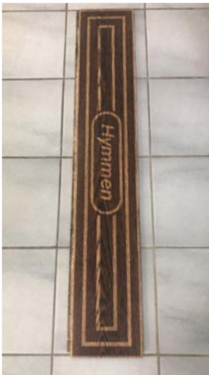
Digitally stained board with logo